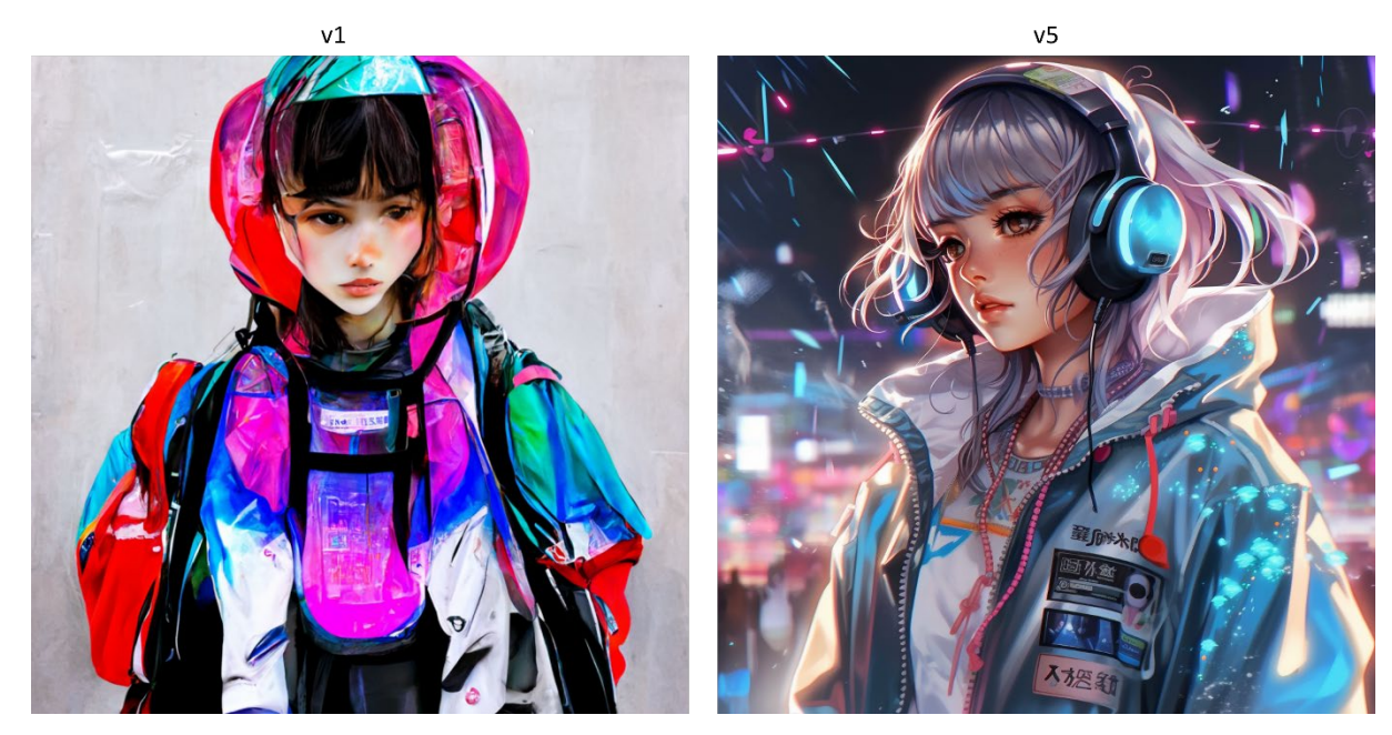
Figure 3.1. Comparison of Midjourney images from v1 to v5

Better text-generation performance on tasks involving language models is likely going forward, given that scaling laws still apply and training smaller models on larger amounts of data for text have demonstrated evidence for increasing language models' capabilities. Rapid developments seem to be even more striking in image generation and systems that draw from sequential data, such as video, music, and voice applications. The short term with likely bring growing impacts from applications that build on generative AI technologies and the industries that will adopt them.