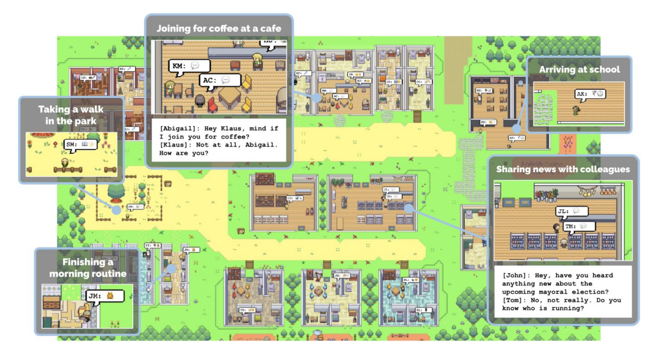
Figure 1.1. Sims-like environment for AI agents